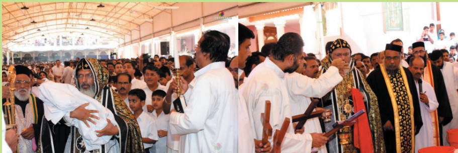
ദുഃഖ വെള്ളിയാഴ്ച സ്മരണ പ്രസക്ത ഭാഗങ്ങൾ

Regular Meeting Nazrani Adukkala (Food Fest) Medical Check-up